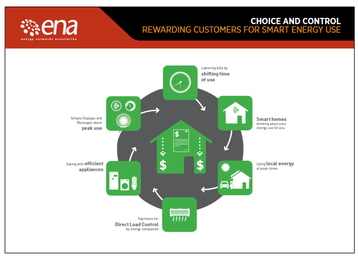
Figure 2: How tariff reform can reward customers for smart energy use