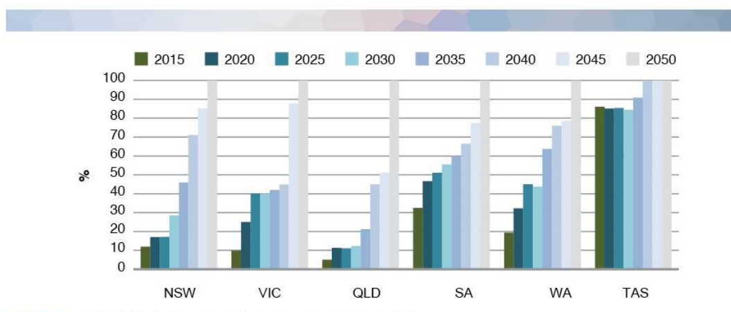
Figure 34: Projected installations of rooftop solar by state.