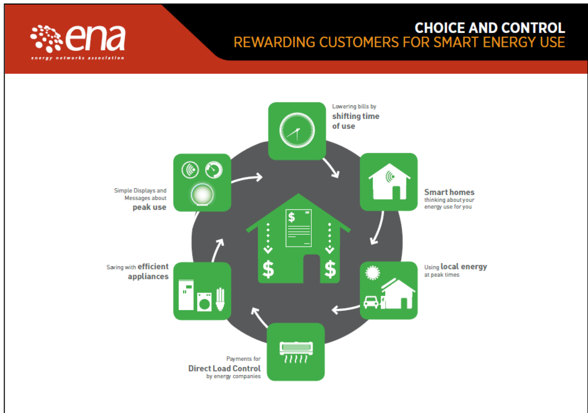
Figure 2: How tariff reform can reward customers for smart energy use